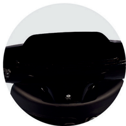
10-inch HD meter