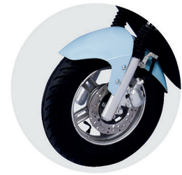
Front disc brake

Disclaimer: This brochure is intended to provide general information, descriptions, and illustrations of the product, including both standard 24x and optional functions. Please note that the equipment depicted in this brochure may not be specific to a particular product, as product specifications are subject to change periodically. For more detailed information, kindly reach out to your local support.