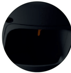
Open front storage compartment