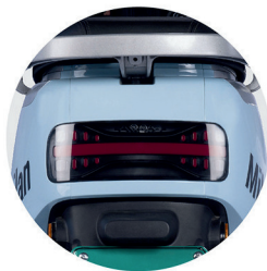
Gentleman collar end light