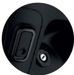
Flip hidden hook